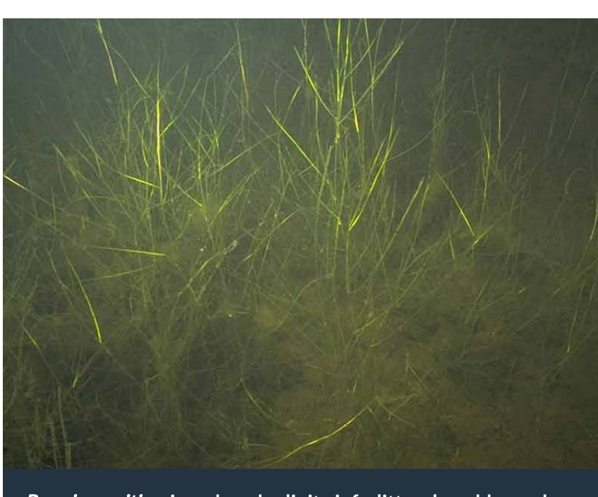
Ruppia maritima in reduced salinity infralittoral muddy sand.