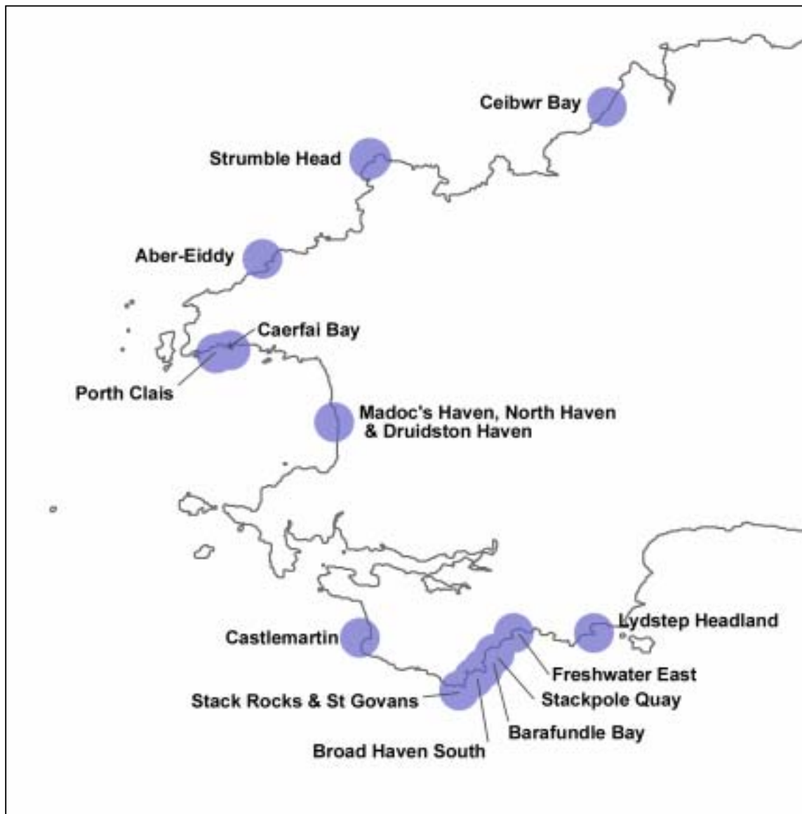
Figure 1. Sites within west Wales where coasteering is known to occur (Green et al. , in prep).