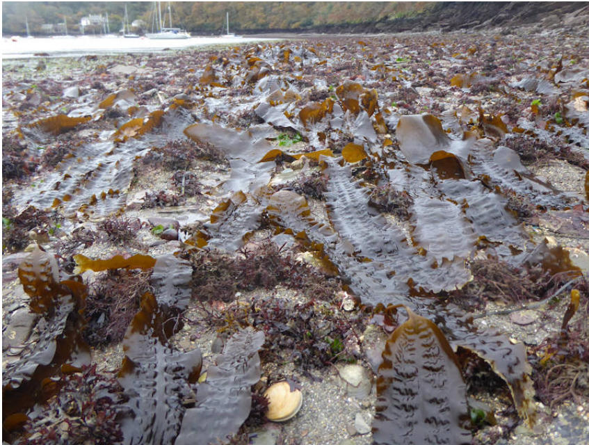
Saccharina latissima and robust red algae on infralittoral gravel and pebble