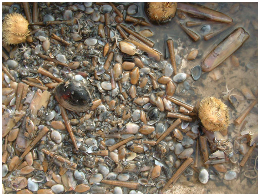
Lagis koreni and Phaxas pellucidus in circalittoral sandy mud