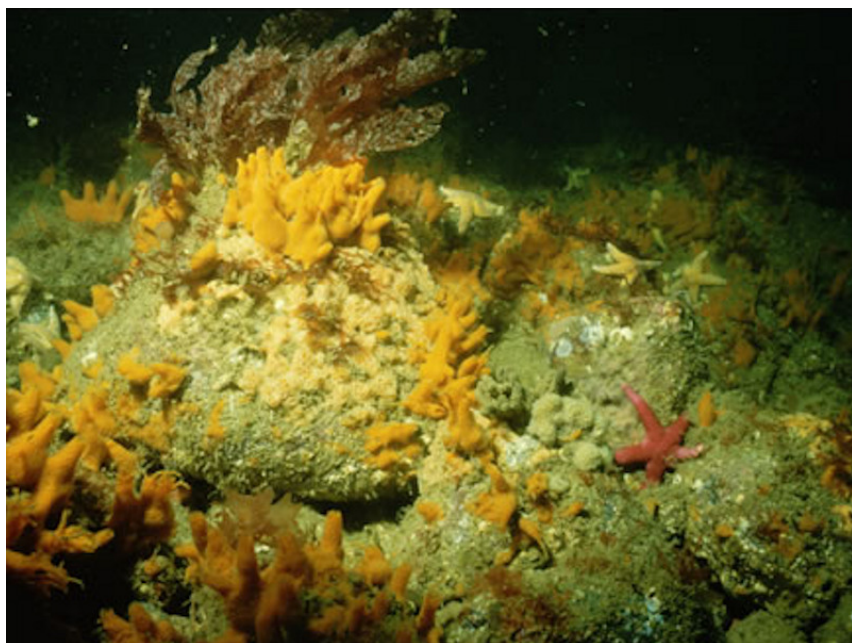
Flustra foliacea and colonial ascidians on tide-swept moderately wave-exposed circalittoral rock