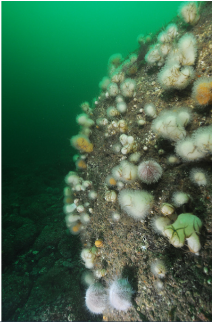
Alcyonium digitatum and faunal crust communities on vertical circalittoral bedrock