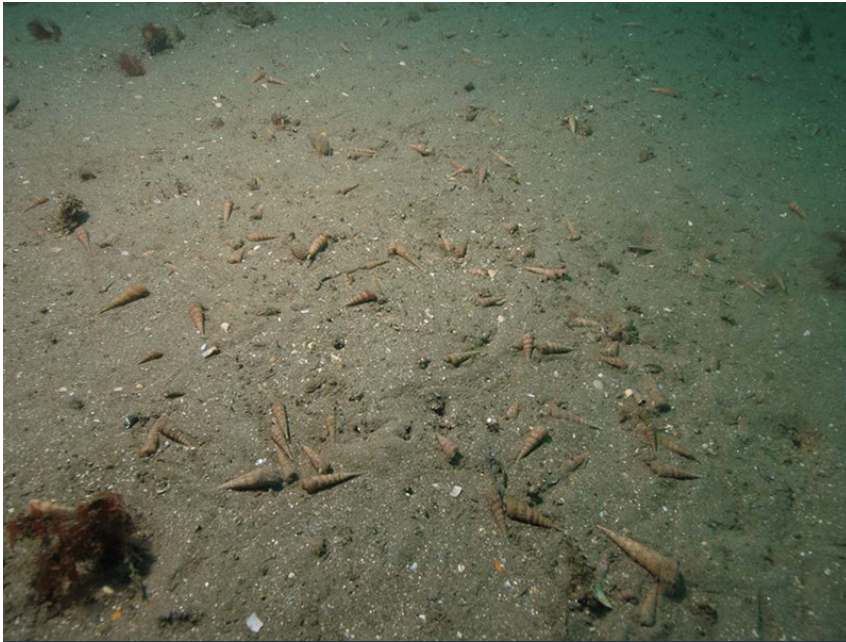
Melinna palmata with Magelona spp. and Thyasira spp. in infralittoral sandy mud