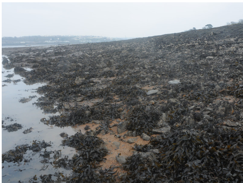
Fucus serratus and large Mytilus edulis on variable salinity lower eulittoral rock