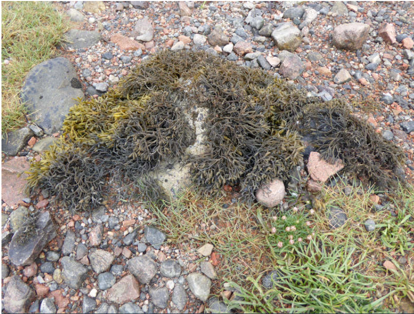
Pelvetia canaliculata on sheltered variable salinity littoral fringe rock