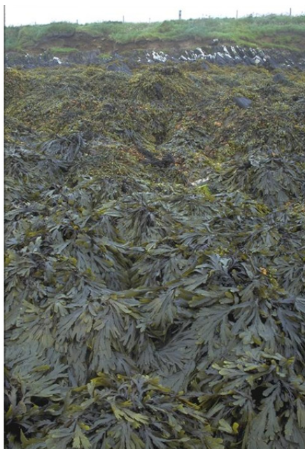
Fucus serratus on full salinity sheltered lower eu littoral rock