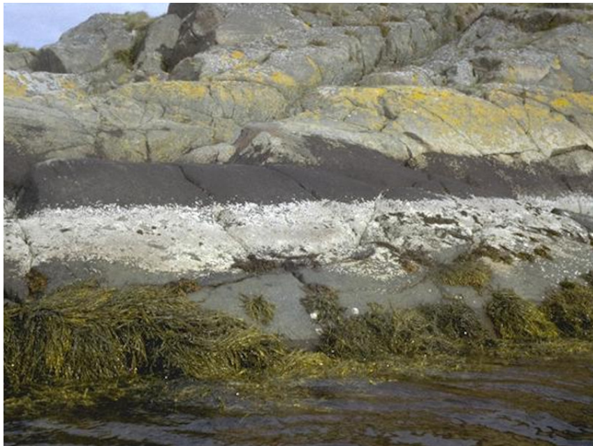
Verrucaria maura on littoral fringe rock