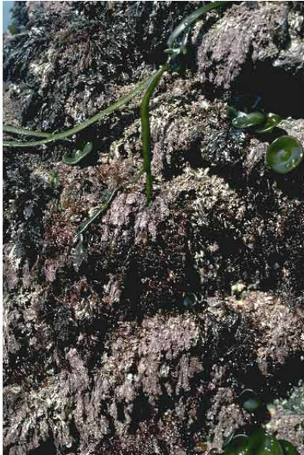
Close up of rock face with Corallina and Himanthalia (ELR.Coff).