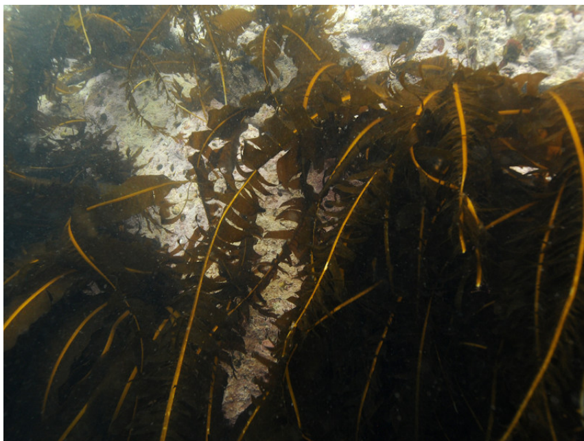
Alaria esculenta on exposed sublittoral fringe bedrock