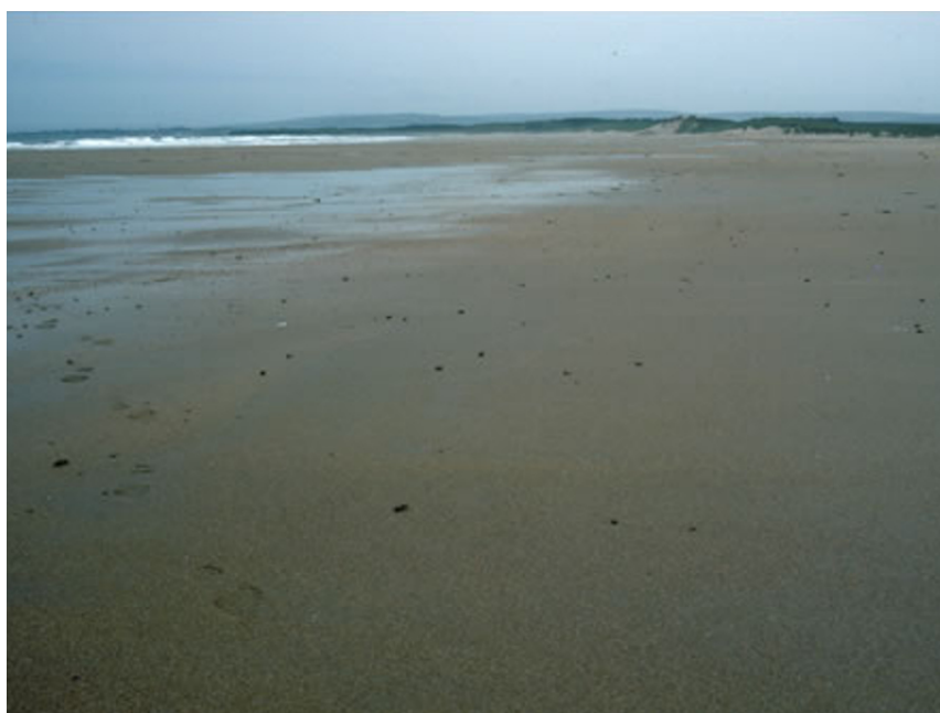
Barren littoral coarse sand