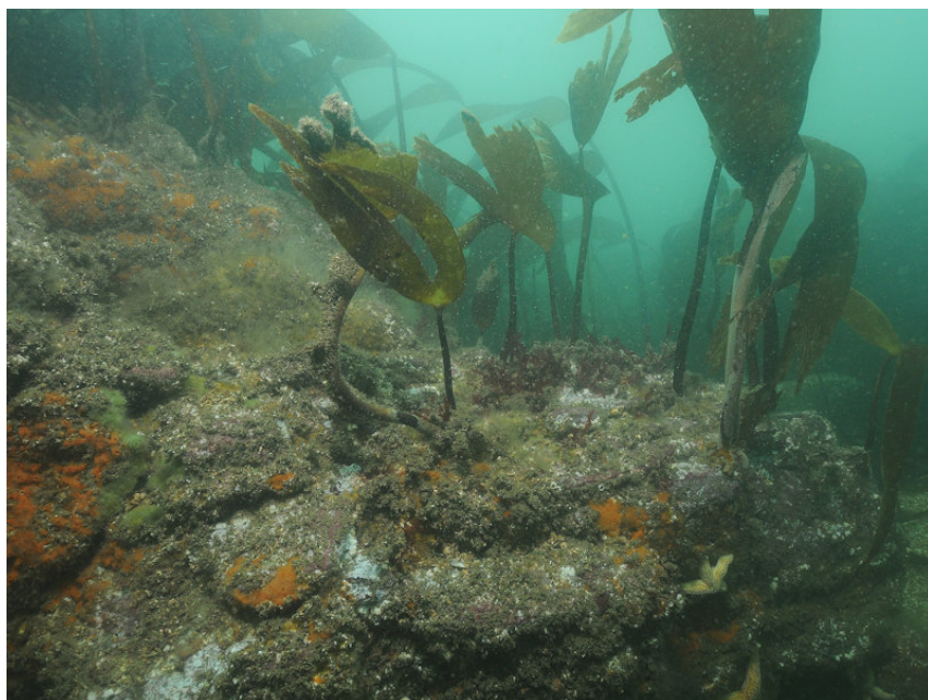
Laminaria hyperborea park with hydroids, bryozoans and sponges on tide-swept lower infralittoral rock