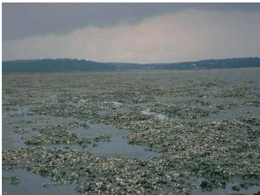
View across a cockle strand (biotope LMS.Pcer).