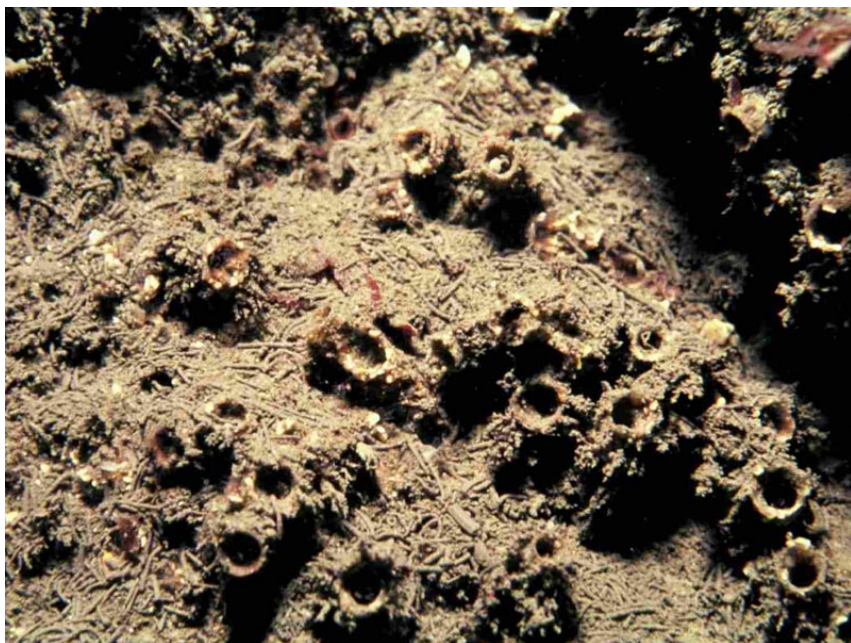
Sabellaria spinulosa crusts on silty turbid circalittoral rock.