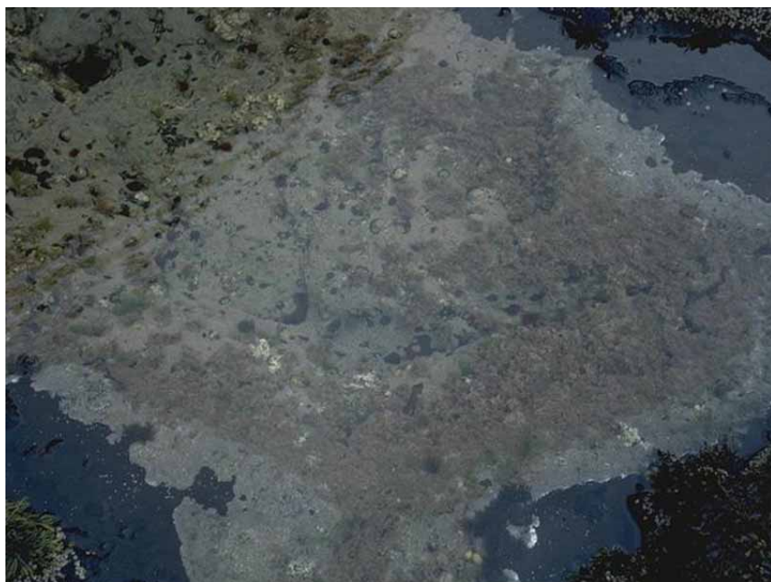
Pool in Pelvetia zone Corallina officinalis and coralline crusts (LR.Cor).