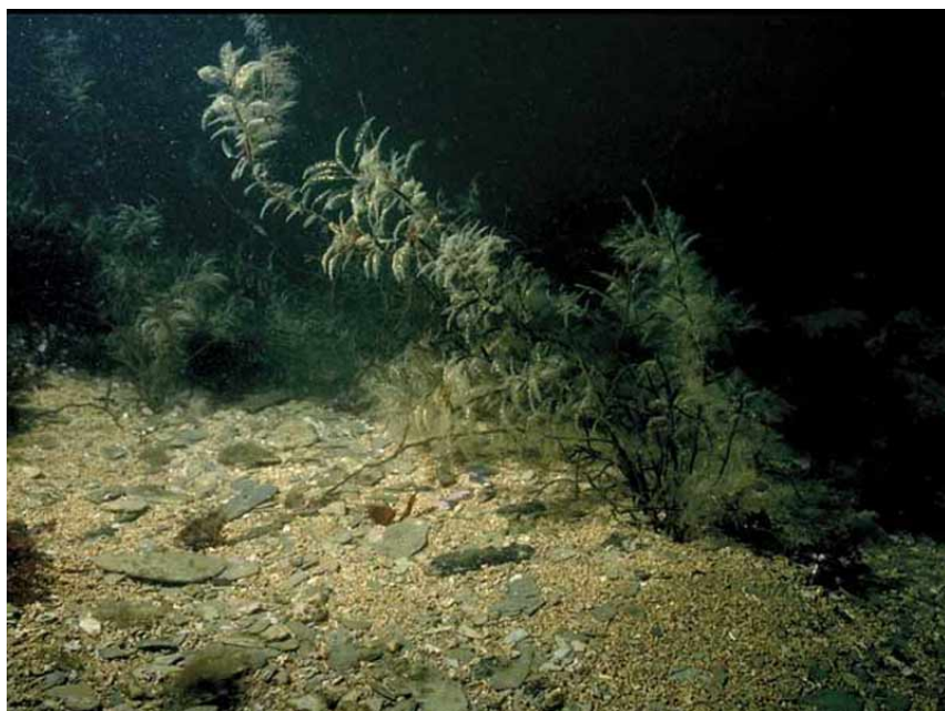
Halidrys on flat pebbles and gravel.