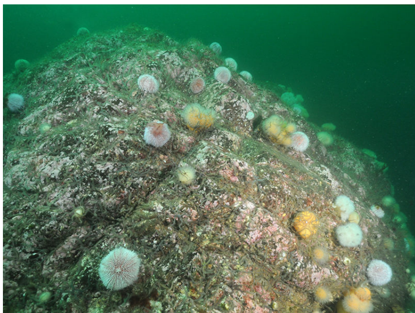
Grazed Saccharina latissima with Echinus , brittlestars and coralline crusts on sheltered infralittoral rock