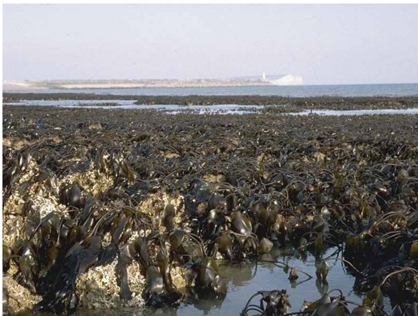
View across shore showing extensive kelp beds on chalk.