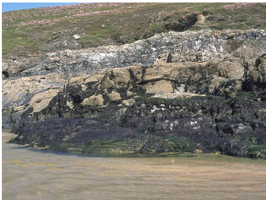
Porphyra purpurea and Enteromorpha spp. on sand-scoured mid or lower eulittoral rock