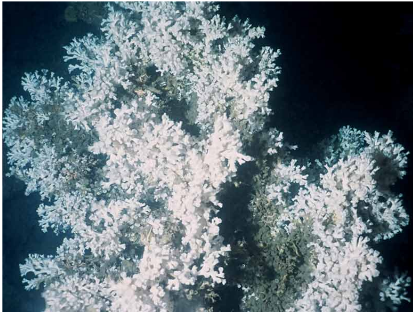
Section of Lophelia pertusa reef, Mingulay, Scotland.