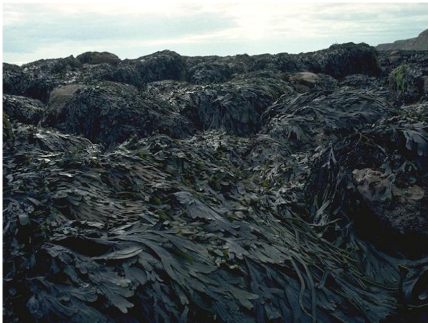
Fucus serratus on sheltered lower eu littoral rock