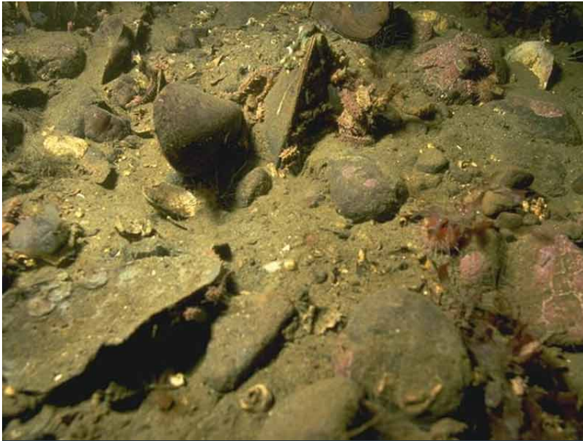
Aggregation of Ocnus planci on broken shell and cobbles.