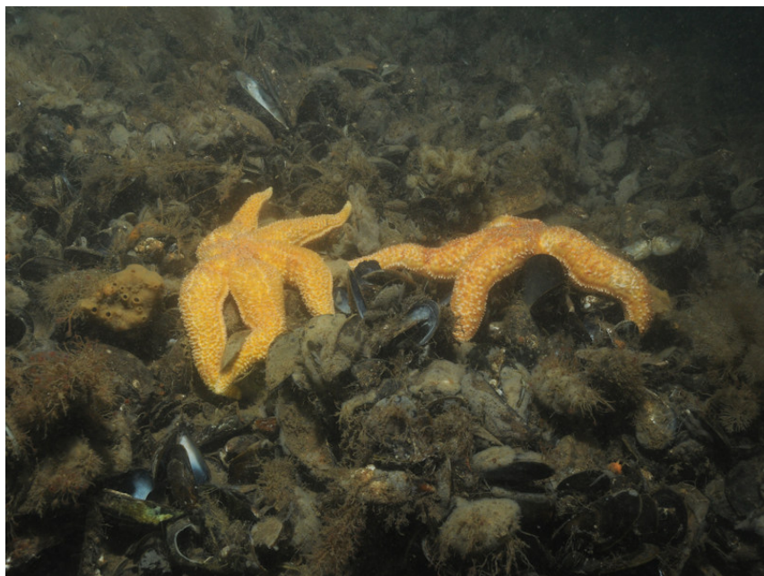
Mytilus edulis beds on sublittoral sediment