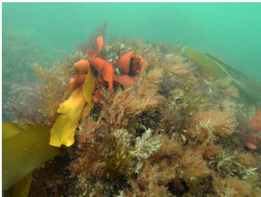
Foliose red seaweeds on exposed lower infralittoral rock