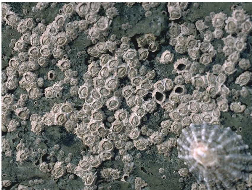
Chthamalus spp. on exposed upper eu littoral rock